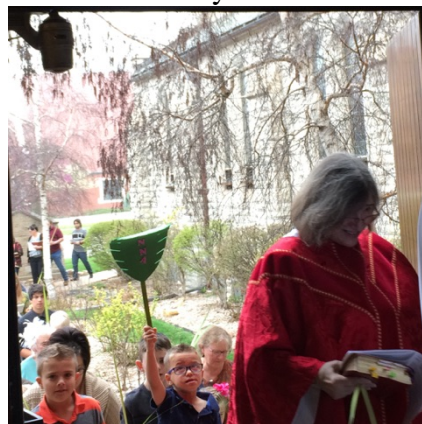
Palm Sunday Procession

for all of her long hours and hard work that she put into cleaning and organizing the kitchen recently. It looks amazing.